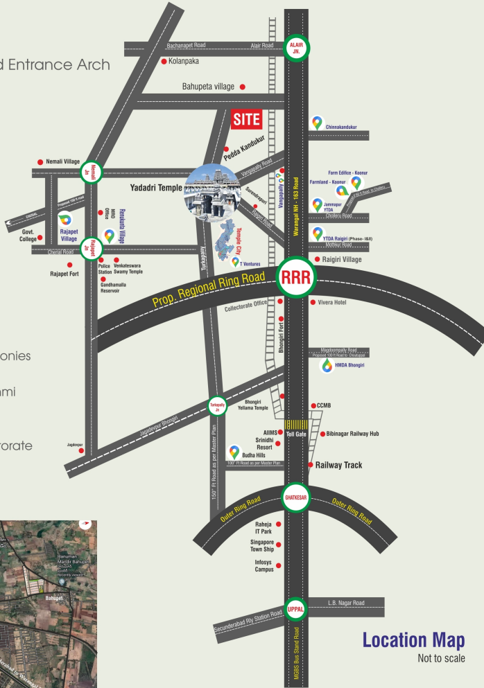
Location Map Not to scale