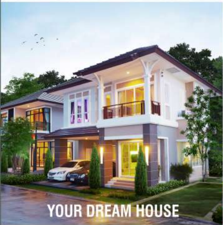
YOUR DREAM HOUSE